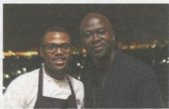
Chef Kwame Onwuachi and David Adjaye